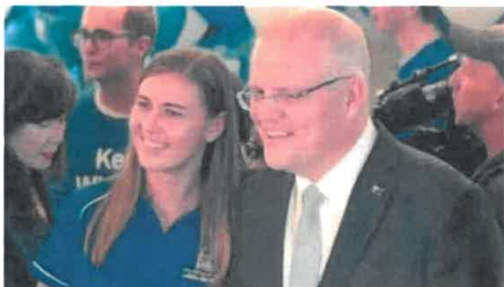
42 Brittany Higgins with Scott Morrison.