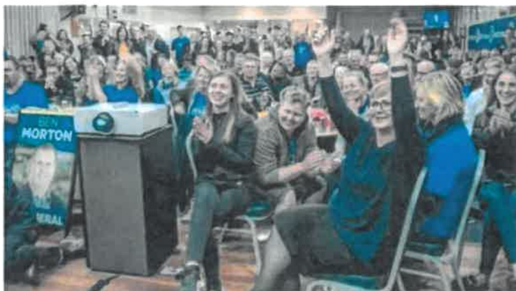
44 Brittany Higgins and Linda Reynolds at a Liberal Party event.

45 On the Tuesday, Ms Higgins was brought to a formal employment meeting about the security breach from her acting chief of staff, a senior Coalition staffer who now works in Prime Minister Scott Morrison's office.