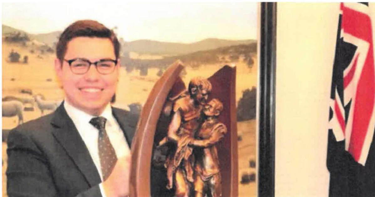
PRIME MINISTER SCOTT MORRISON